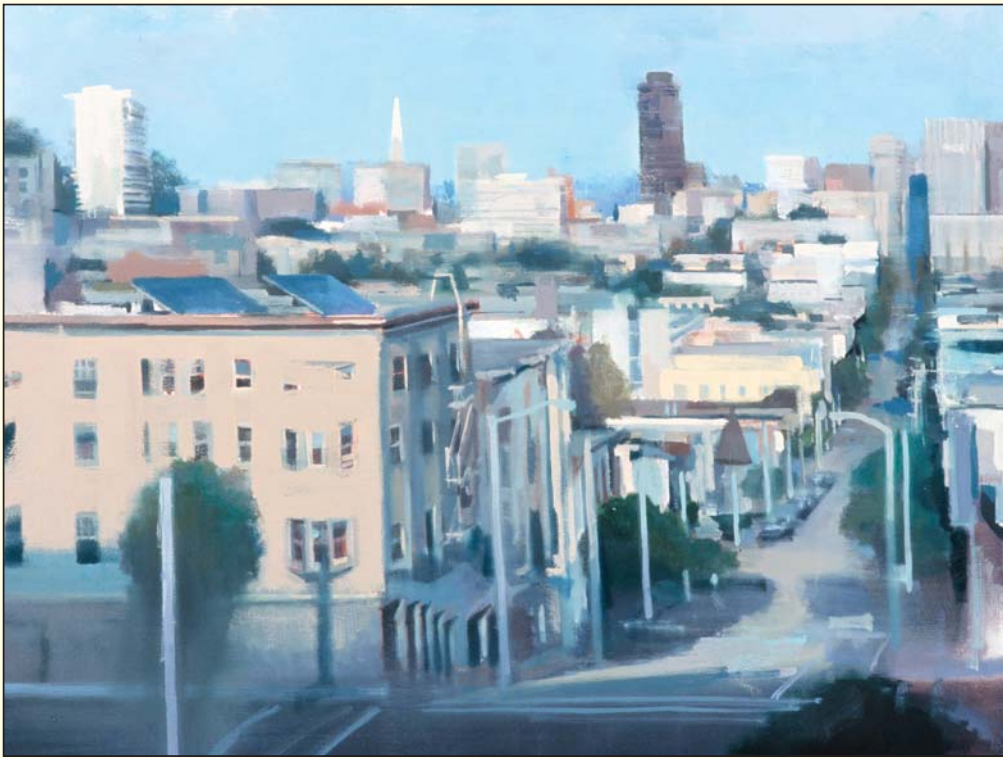
GAGE OPDENBROUW, From Masonic #1 , 2007, oil on canvas, 18 x 24"