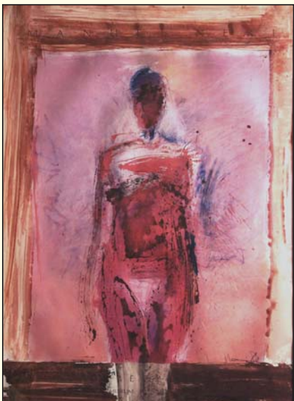
MANUEL NERI, Pink Figure , 1980 handworked announcement, 30 x 22"