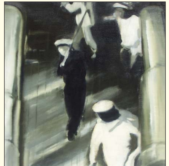
CHRIS BROWN, Under the Guns , 1993 oil on linen, 30 x 30"