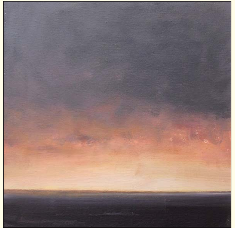
GAGE OPDENBROUW, Last Golden Light , 2006, oil on canvas, 12 x 12"

CELEBRATING THE CALIFORNIA COLLEGE OF THE ARTS (CCA) CENTENNIAL